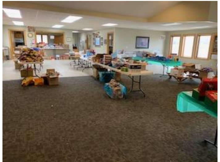
Ready to pack