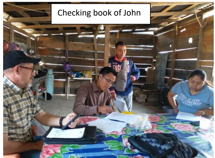
Checking book of John