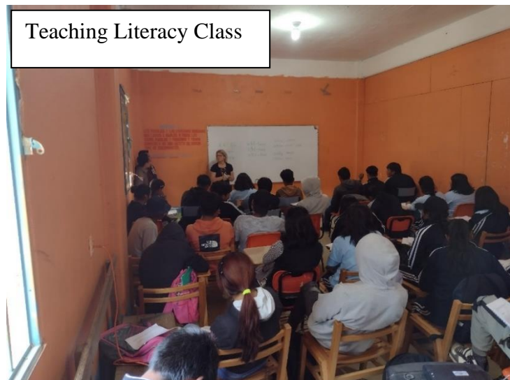
Teaching Literacy Class

there would be about 30 students taking the class but when we taught our first lessons March 21, the room was packed with over 50! May God allow each and every one of them to learn to read and write their language in preparation for reading God’s precious Word in their mother tongue!